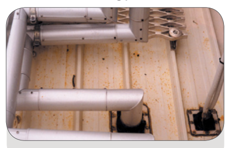
Figure 1 Swarf staining

Many swarf staining problems arise not only from installers, but also from following trades working in the vicinity. Architects, builders and project managers need to be aware of this possibility, and warn contractors accordingly.