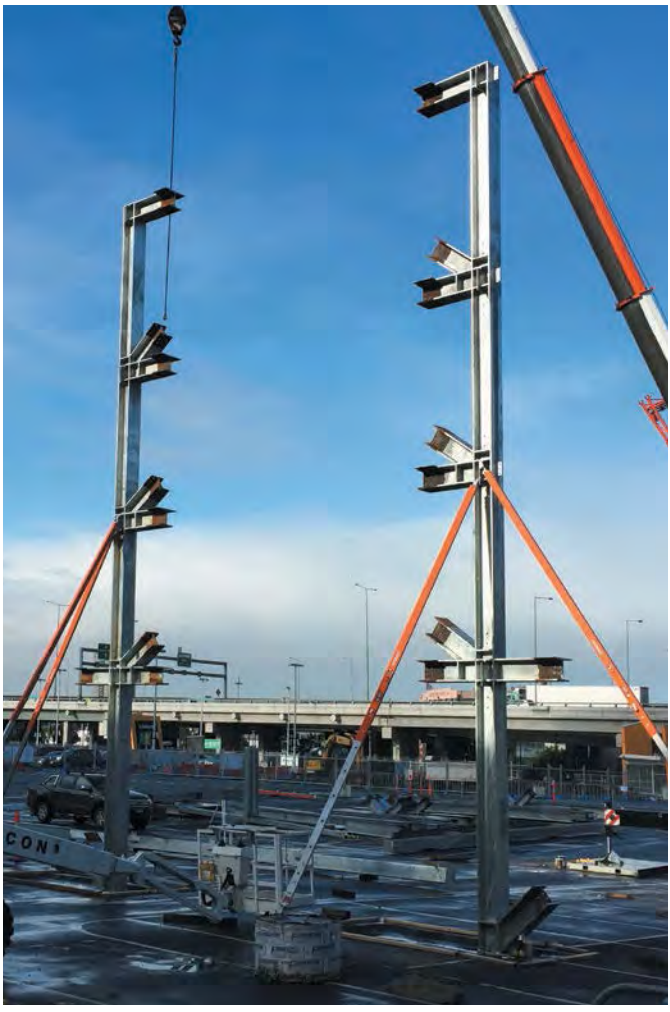
Starting up with the 13-metre high columns.

The structural grade steel was supplied directly from OneSteel's Whyalla steel mill in South Australia. All steel frame components were galvanized.