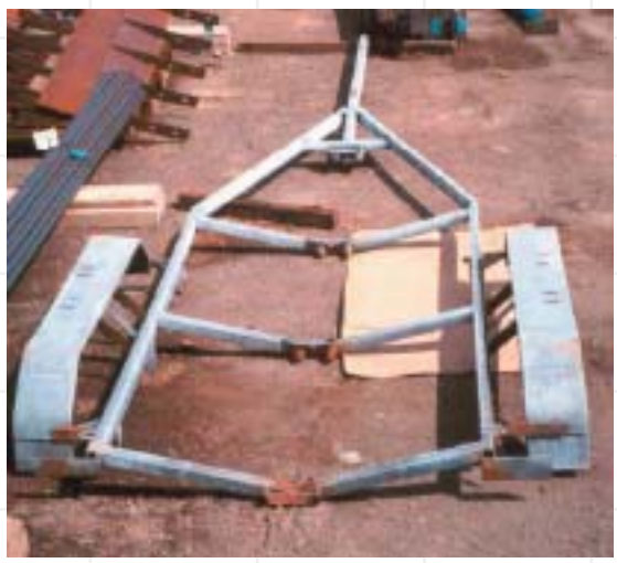
The re-galvanizing of old boat trailers will restore them to 100% original condition. Boat trailers, anchors and chains are routinely regalvanized to restore their original corrosion prevention performance.

galvanized steel. It is a high solvent coating with a recommended