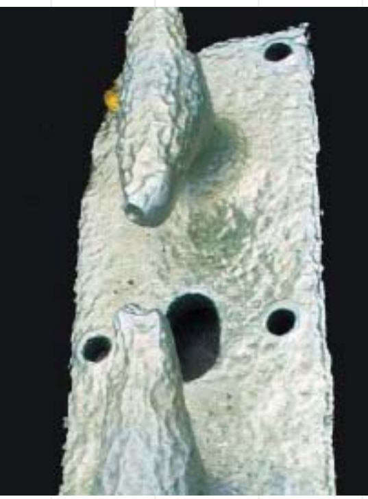
This 50-year old cast marine bollard has been hot dip galvanized. Although it is badly pitted, the bollard was easily re-galvanized to restore its durability.

Galvanized coatings are alloyed to the steel, and the zinc in the coating acts as an anode to prevent the steel from corroding while any zinc is present. The galvanized coating closest to the steel surface has higher levels of iron in the alloy layer (about 10%). This gives some early warning of the end of the galvanized coating's life on ageing infrastructures.