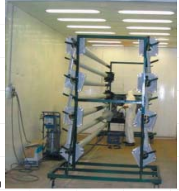
Superior Coaters uses a batch powder coat-Estate Poles. On-site garnet blasting facilities

The presence of pinholes gives chlorides and other corrodents access to the zinc substrate with consequent production of bulky zinc corrosion products which leach out through both amide (epoxy) and polyester coatings.