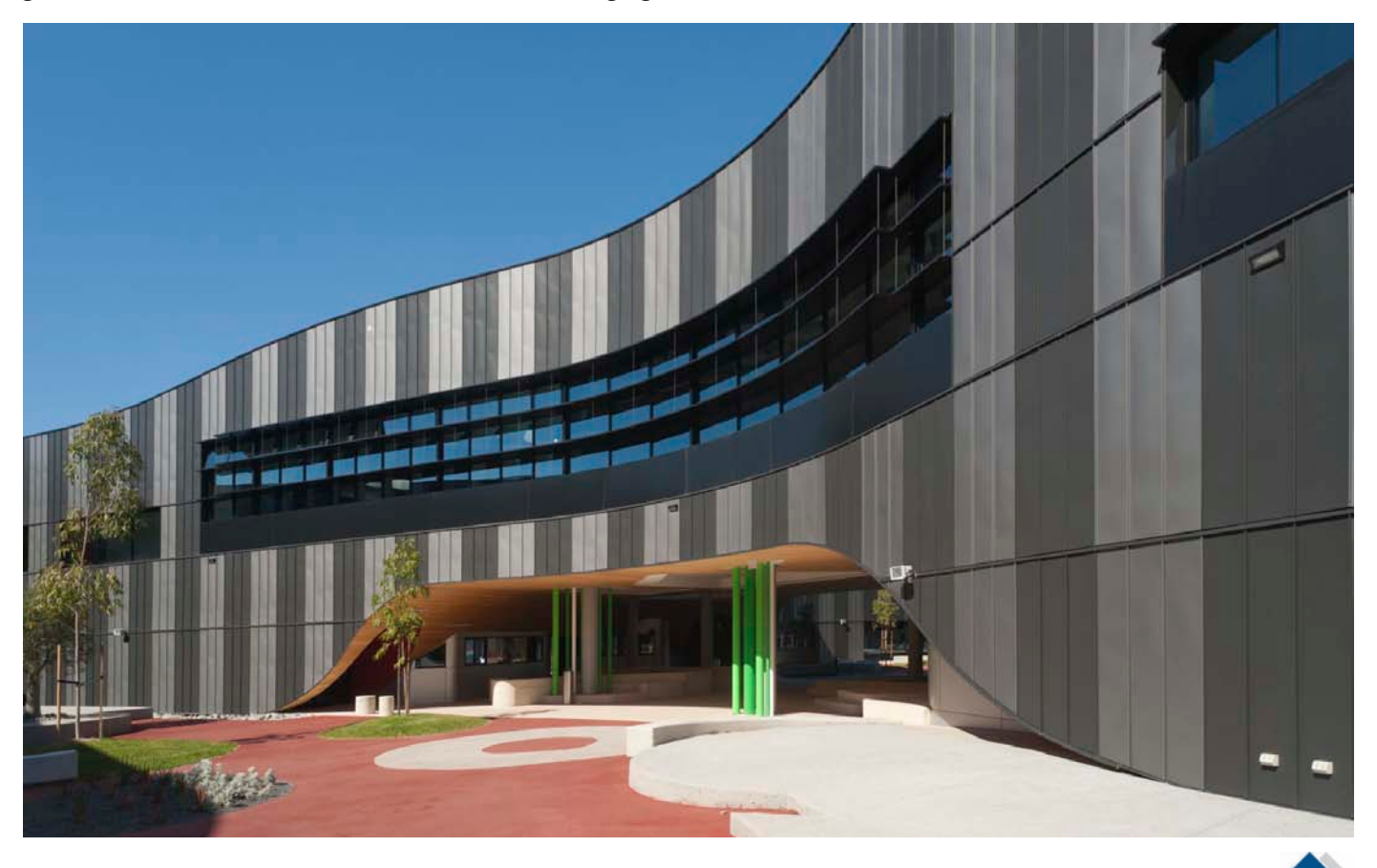
Australian Steel Institute Level 13, 99 Mount St, North Sydney, NSW 2060