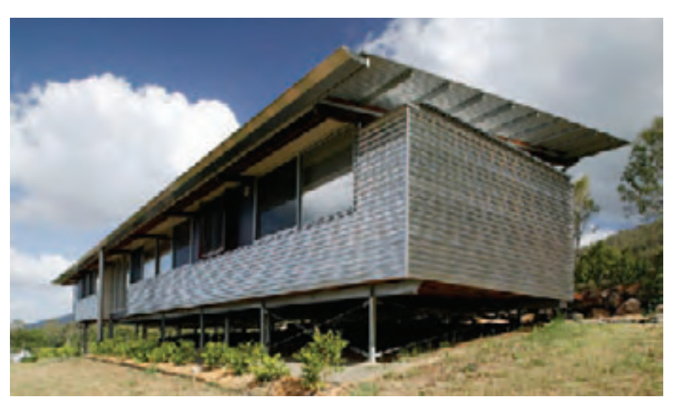
The elevated steel frame maximises the views, minimises site disturbance and provides effective low cost termite control.