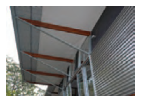
The roof has ventilation slots to allow convection cooling to the roof cavity.

There is honest, direct and simple detailing in the residence which provides a finer grain of elaboration and expression particularly at the steel to timber connections.