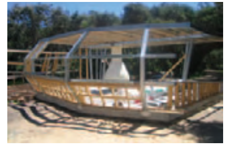
The angled planes of the bedroom wing walls were enabled by steel wall beams and cranked circular hollow section columns.