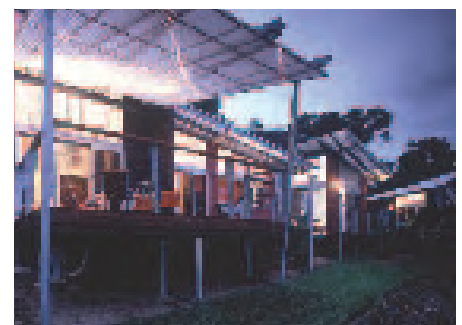
Steel framed tropical rooftops catch and direct the prevailing south easterly sea breezes through to doors and windows