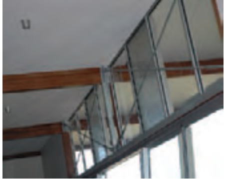
The connections have been kept simple and are repeated and standardised.