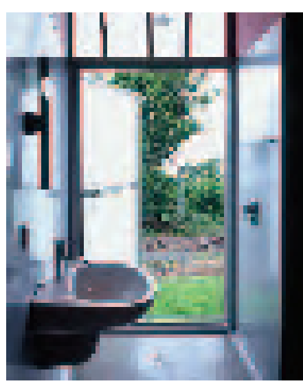
Steel features prominently throughout the house in the structural framework with custom-made steel frame doors providing natural light to bathroom areas.