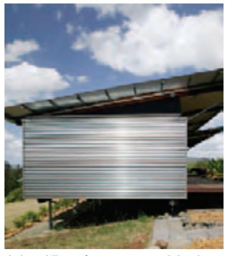
The large skillion roof creates a generous sheltered outdoor area and high internal ceilings.