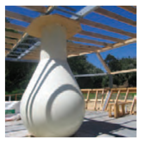
In the living room the ceiling wraps down to an internal bulb-shaped water tank.