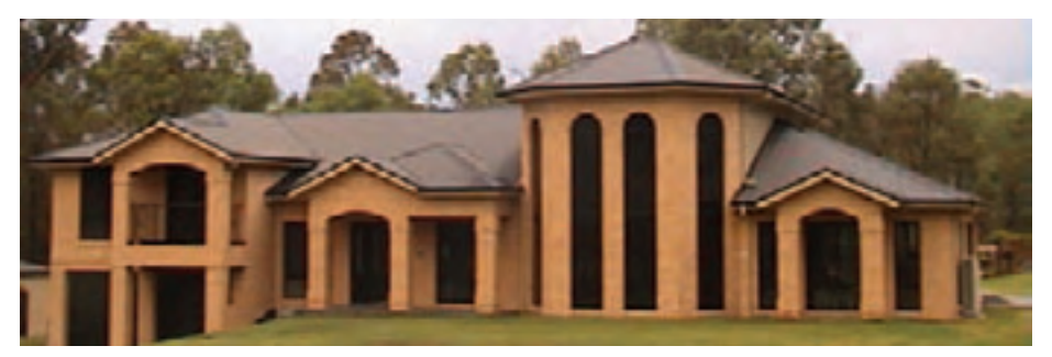
This feature combined with the use of Colorbond® roofing allowed for wide spans for the steel roof trusses thus providing an economical and durable structure.