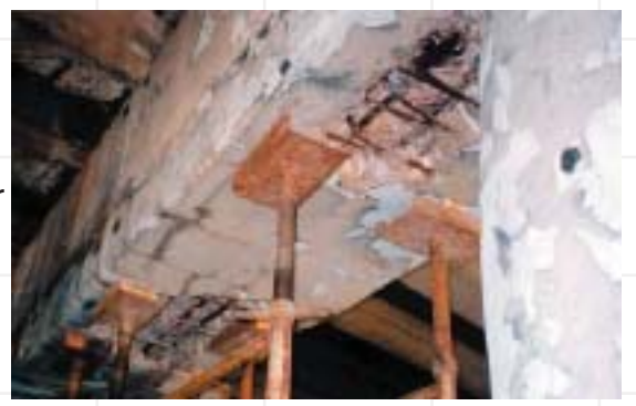
The corrosion of the reinforcing bar in this road bridge in North America has occurred because of poor rebar placement combined with the use of de-icing salts on the road.

In most cases, reinforcing bar is used without any protective coating and relies on the passivation of its surface by the highly alkaline cement.