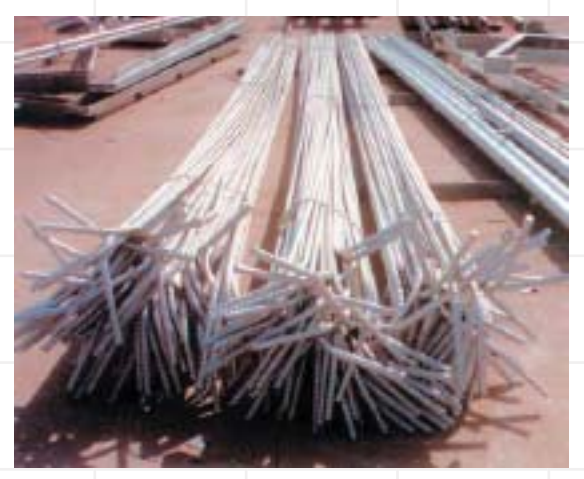
Reinforcing bar in routinely galvanized throughout Australia, where concrete durability is critical

This can be done using anodes or impressed current from a power source. Cathodic protection systems are best designed into the structure and their design and installation is a