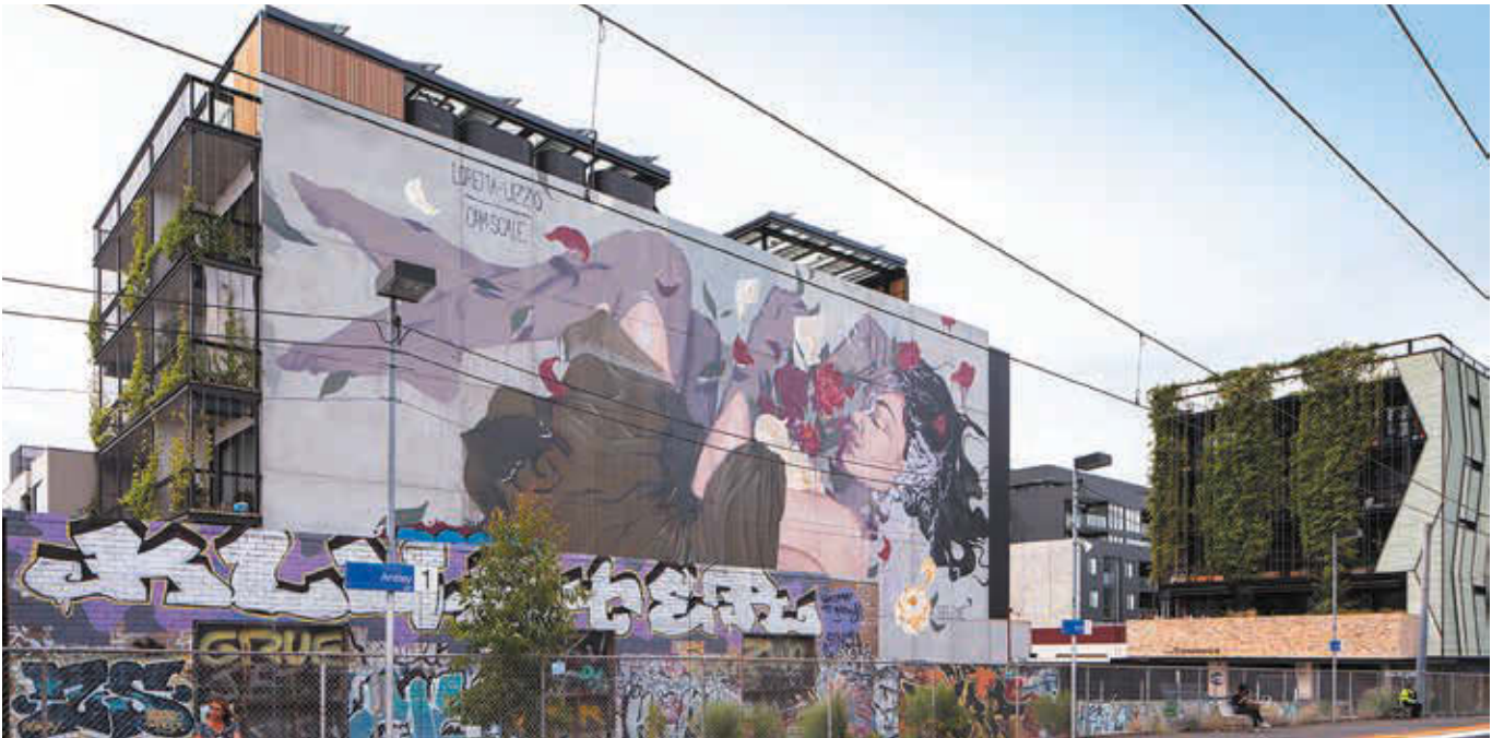
Building on the success of Brunswick's The Commons project, Nightingale 1.0 by Breathe Architecture contains 20 apartments, 57 bike parking spaces and zero on-site carparking. It's the first in a series of affordable apartment developments taking place across Australia.