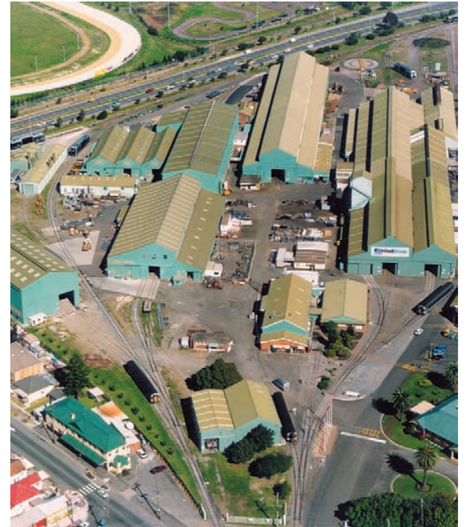
United Group Rail's Broadmeadow facility from where the new diesel electric locomotives will be delivered.

The locomotive platforms are produced in a modular form for ease of manufacture and onsite logistics. They are then brought together to form the assembled platform.