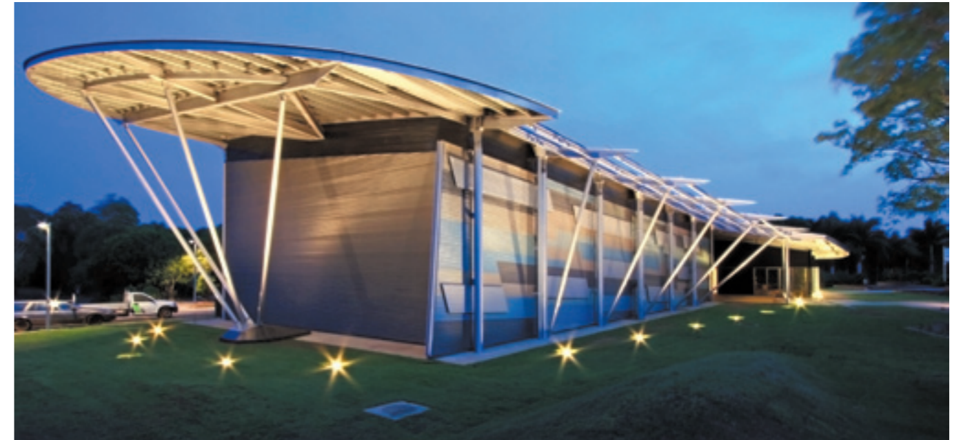
Hinkler Hall of Aviation

The steel detailing was inspired by connections used in the construction of older airplanes and the overall building is reminiscent of a hangar. Structural steel was selected for its spanning qualities, visual lightness, prefabrication ability and low maintenance qualities. The internal building program required large clear spans to allow maximum flexibility for the interpretive design. The ability to resist cyclonic wind loadings also worked to steel's favour. The primary space has a clear span of 16 metres that accommodates five historic planes. Having one subcontractor responsible for the shop drawings and fabrication helped to tighten communication in this critical process.