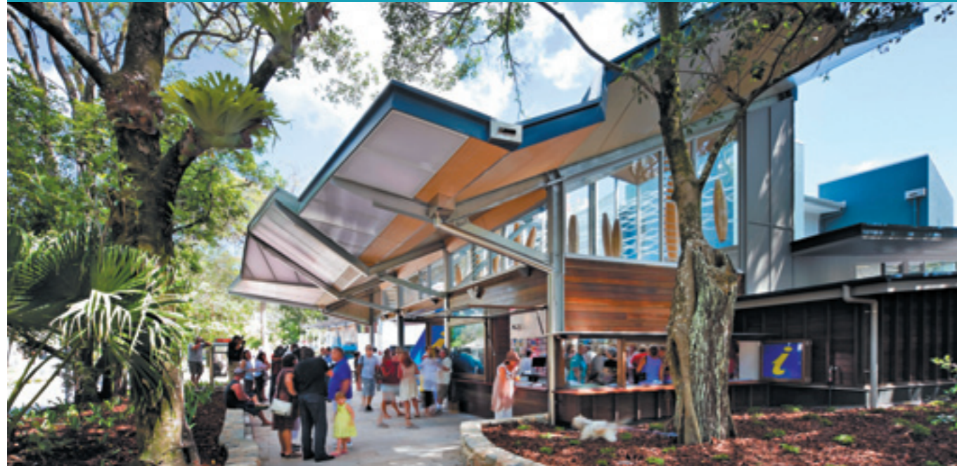
Noosa Visitor Information Centre

The winners of this year's ASI Steel Design Awards 2009 for Queensland well represented the wide array of important public uses which structural steel excels – a tourism centre, a sports complex, a bridge and a museum.