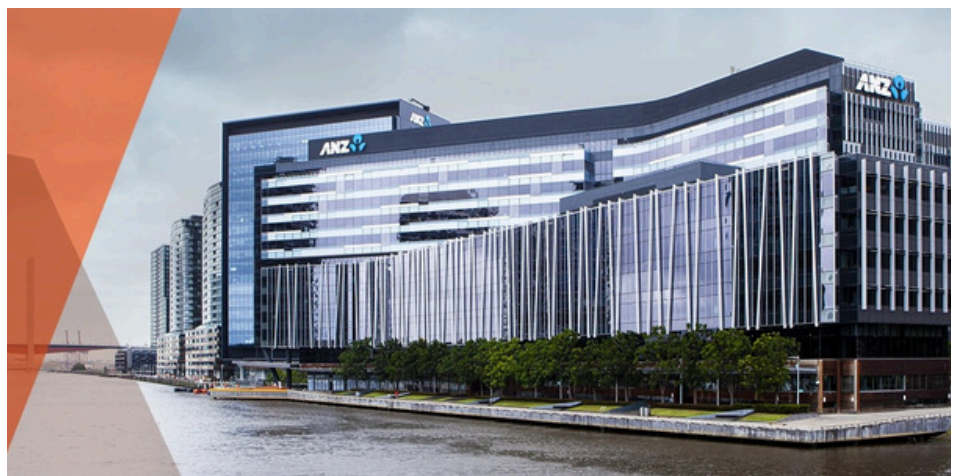
ANZ Victoria Harbour ... PSV advised on this 6-star green rated building

New ASI professional member PSV Consulting Engineers has welcomed Victorian Government plans to address Melbourne's housing crisis by unveiling 25 new activity centres around train and tram stations to boost housing density and affordability. A leading provider of structural engineering independent certification services, Melbourne-based PSV has carved out a niche in the affordability space working with building surveyors, engineers, builders, and developers on among other projects the 434-apartment Boyd Village development in Southbank that includes 40 affordable rental units for low-income people. Affordable housing is just one part of the company's consulting engineers brief over 35 years, with its other projects including the Melbourne Arts Precinct transformation project delivering a new 18,000 square metre urban garden filled with biodiverse planting, public art and places for rest; more space for outdoor art and performances; and engineering certification services for the construction a new 55,000 seat Northern Standard facility at the MCC. Details: https://www.steel.org.au/industry-directory/psv-consulting-engineers/ .