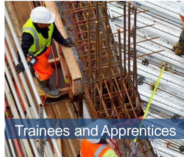
Trainees and Apprentices